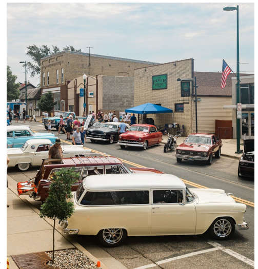
The annual Springfest Artisan Fair was held on Saturday, June 3rd from 9am-3pm on Historic Downtown Norwood. The event featured creative vendors, car show, live music, quilt show, photography contest, kid events and more! Springfest was organized and sponsored by the NYA Area Chamber of Commerce and local businesses.

Submitted by the Willkommen Heritage & Preservation Society