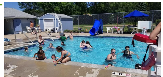
West Carver Community Pool Open Swim Mon-Thurs 1:00pm-4:30pm, 6:15pm-8:30pm Fri-Sun 1:00pm-7:00pm Fridays are subject to change for lesson make-up days. to 1:00pm-4:30pm, 6:15pm-8:30pm