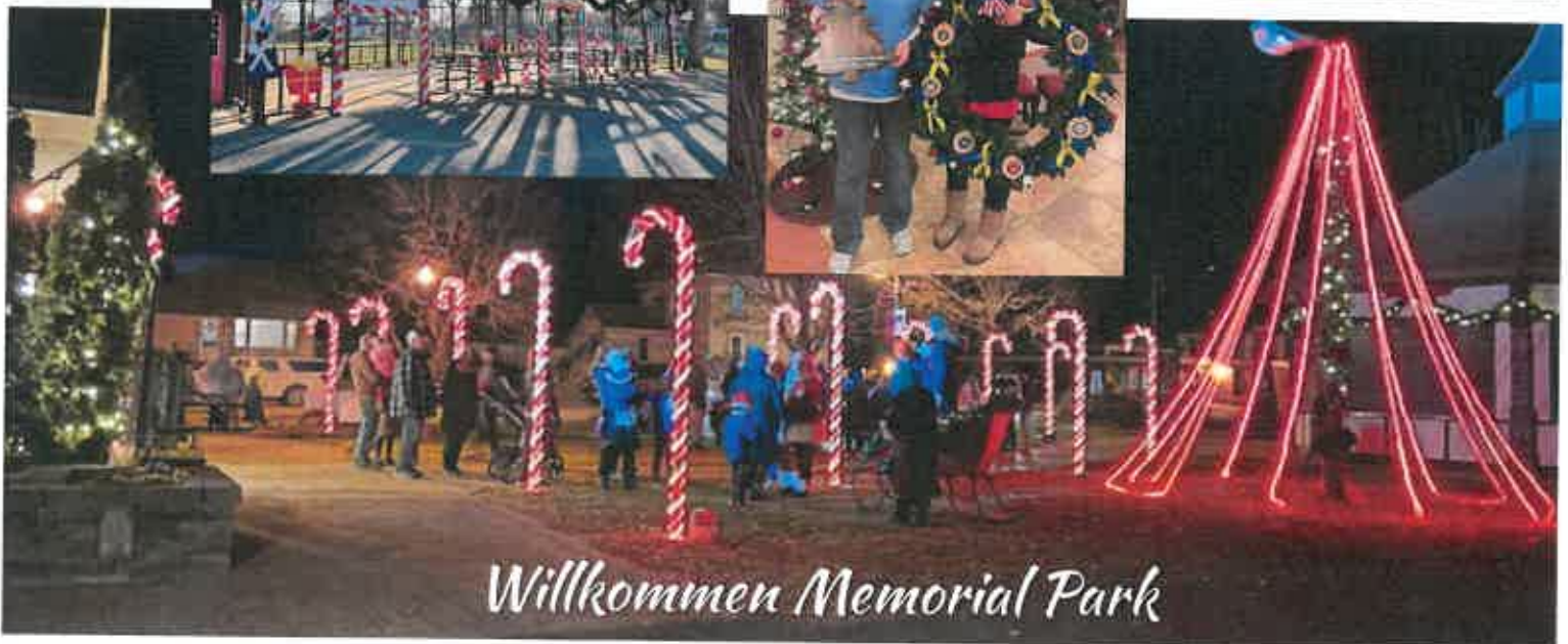
Willkommen Memorial Park